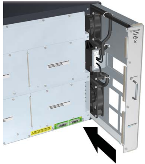
Figure 4. 8212 Fantray being installed

© Copyright 2007 Hewlett-Packard Development Company, LP. All rights reserved. The information contained herein is subject to change without notice.