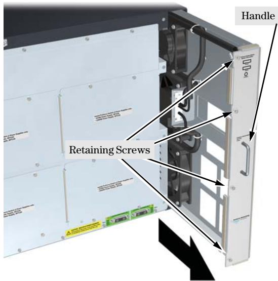
Figure 3. 8212 Fantray being removed